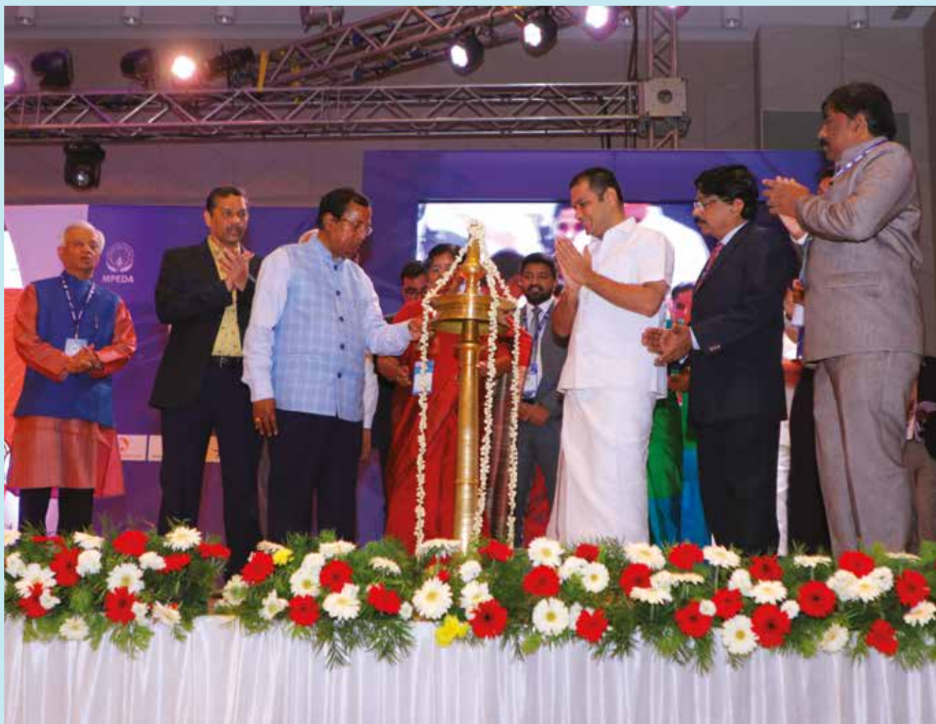
Mr. Som Parkash, Union Minister of State for Commerce and Industry inaugurates the MPEDA Export Award function

Union Minister of State for Commerce and Industry Mr. Som Parkash, who addressed the summit on the second day (Feb 8), assured that the Central government would help the seafood sector in all possible ways to make India the number one exporter by “working together with a new vigour with all the stakeholders, including the state governments and the MPEDA.”