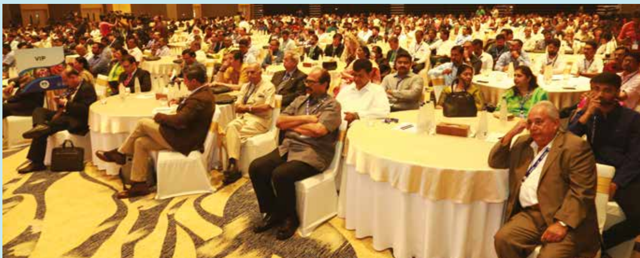
Audience in the inaugural session of IISS 2020