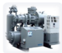
iZα series for F-Gas ET Range -30 °C to -65 °C