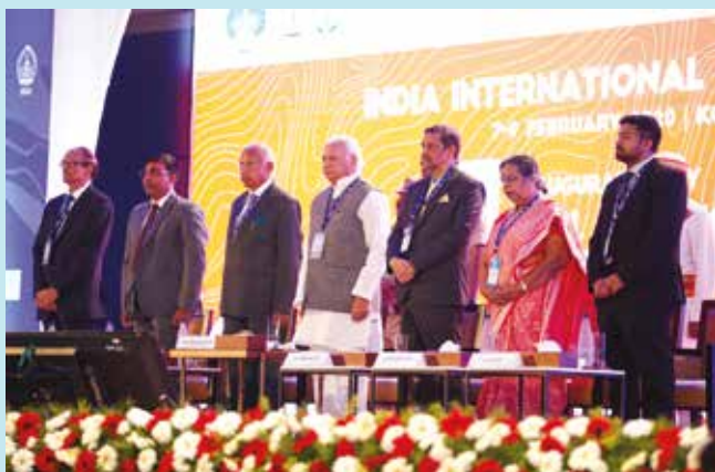
Dignitaries on the dais