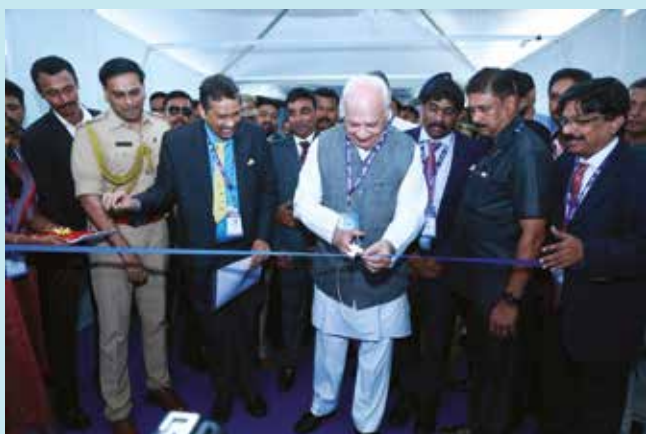
Inauguration of the exhibition hall