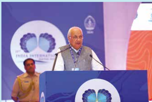
Mr. Arif Mohammad Khan, Hon'ble Governor of Kerala delivers the inaugural address