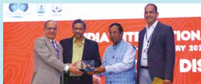
M/s. Gadre Marine Export P. Ltd., Ratnagiri receiving Chairman's special award for the most Responsible Exporter of the year