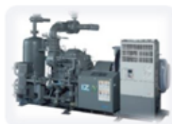
iZN series for NH3 ET Range -30 °C to -50 °C

Cooling capacity control by inverter & iZ controller Result: Linear capacity control No Gas By-pass