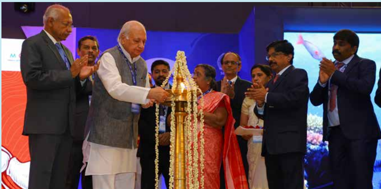
Mr. Arif Mohammad Khan, Hon'ble Governor of Kerala inaugurates the India International Seafood Show 2020 by lighting the ceremonial lamp

T he 22 nd edition of the India International Seafood Show (IISS 2020) was held at Kochi, the commercial nerve centre of Kerala, from February 7 to 9, 2020 with 'Blue evolution: Beyond Production to Value Addition' as the focal theme. The objective was to bring into focus the latest technological interventions and advancements in aquaculture sector and highlight the country's commitment towards sustainability in the entire value chain of seafood products such as primary production, processing and transportation.