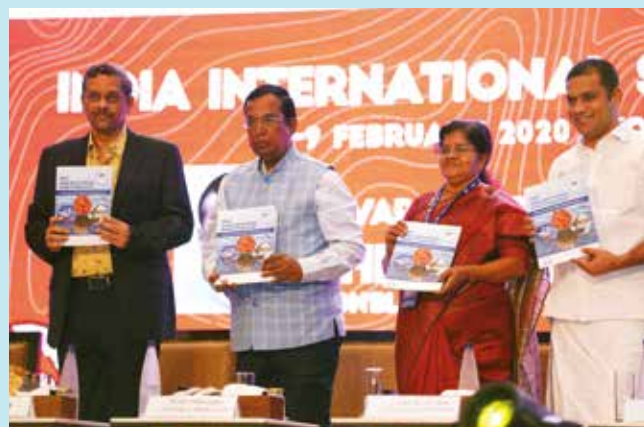
Releasing of IISS 2020 Souvenir