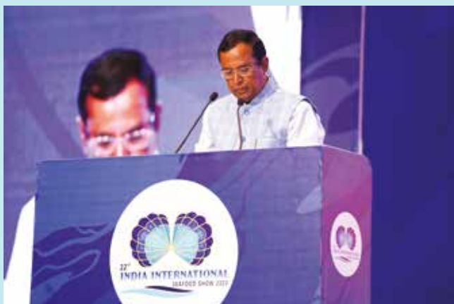
Mr. Som Parkash, Union Minister of State for Commerce and Industry addressing the audience