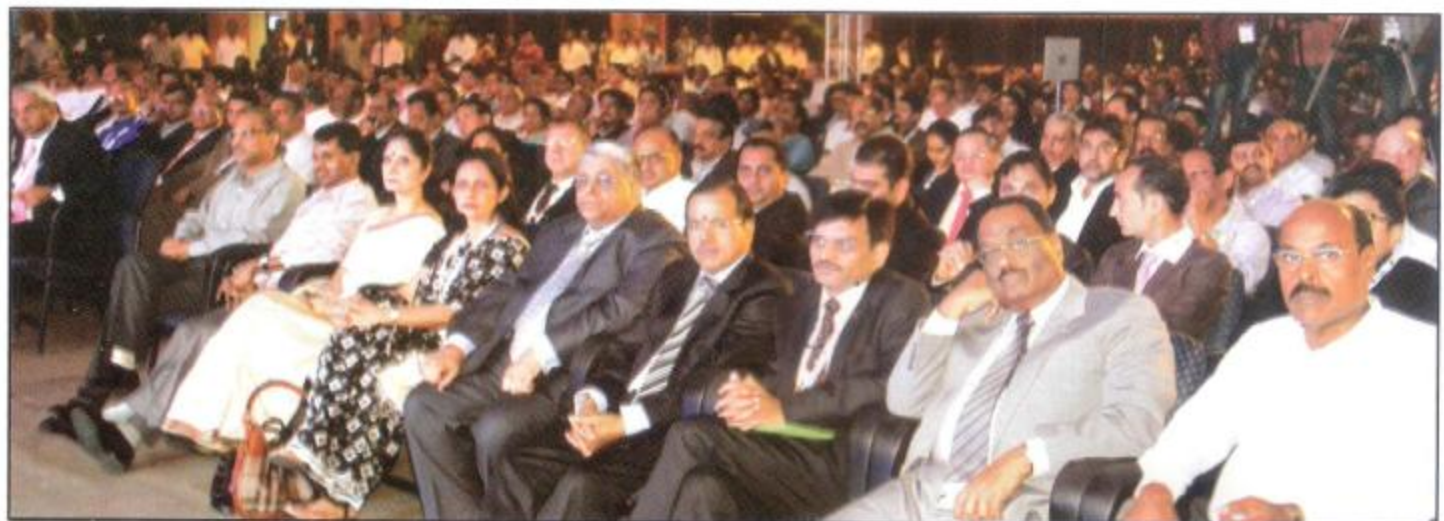
A view of the audience at the inaugural ceremony

Hon'ble Minister of Commerce & Industry, in his inaugural address called upon the financial institutions of the country to help the fisheries sector in buying bigger vessels and to promote aquaculture so that the country can take advantage of its 8,000 km coast line and 2 million sq. km. EEZ. The Minister praised the cluster farming initiatives by the MPEDA in the four southern states that have led to an "exponential growth in