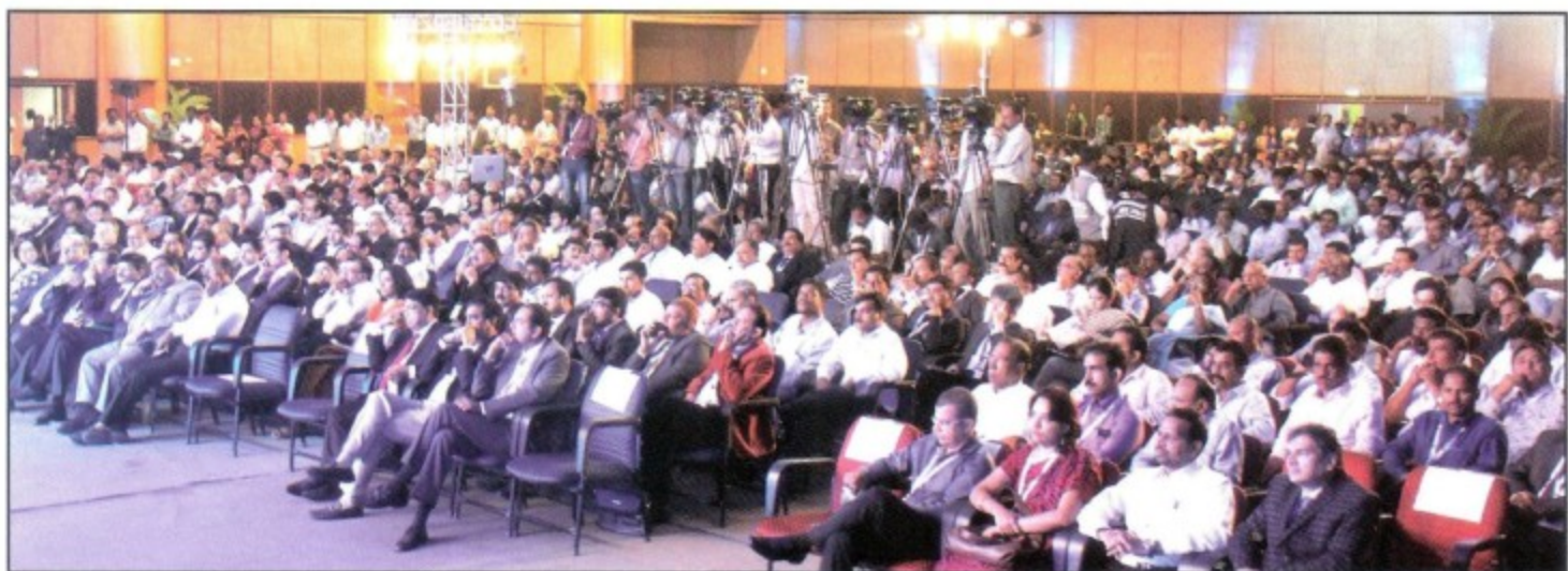
Another view of the audience

The 20 th edition of India International Seafood Show will be held at Chennai Trade Centre from 22 nd to 24 th January 2016.