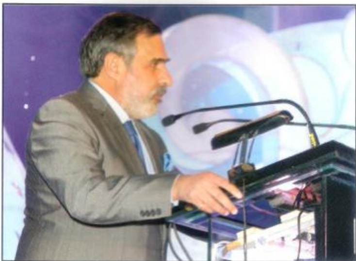
Inaugural address by Mr. Anand Sharma, Hon'ble Minister of Commerce

history and mile stones of MPEDA with illustrations on the occasion commemorating MPEDA's 40 years