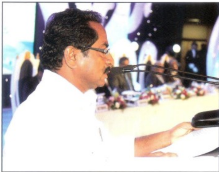
Thiru K A Jayapal, Minister of Fisheries, Govt. of Tamilnadu felicitates the IISS-2014