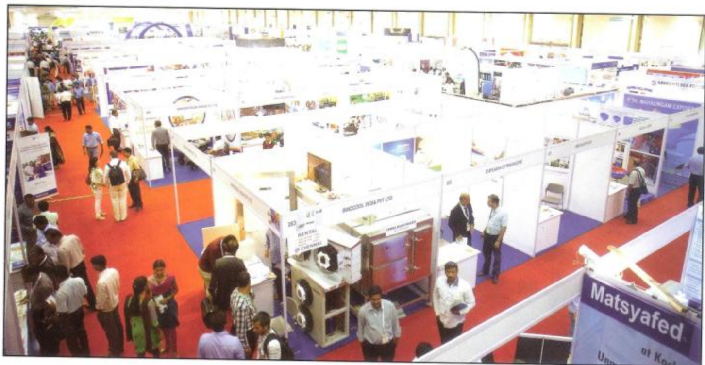
A view of exhibition

Chairman, MPEDA while welcoming the august audience emphasized that the IISS has emerged as a premium seafood expo which gives the seafood export fraternity a great opportunity to meet, exchange ideas