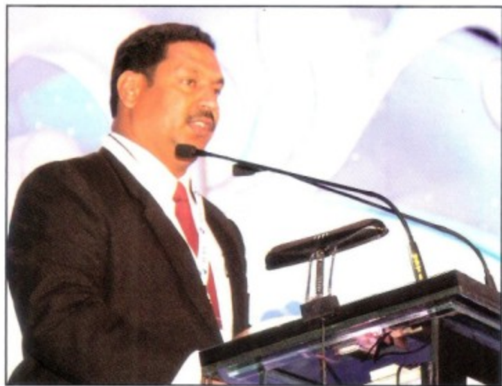
Felicitation address by Mr. Avatano Furtado, Minister for Labour & Employment, Fisheries, Rural Development, Govt. of Goa