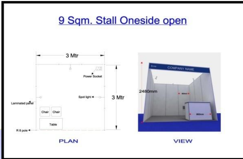
Fig - 1