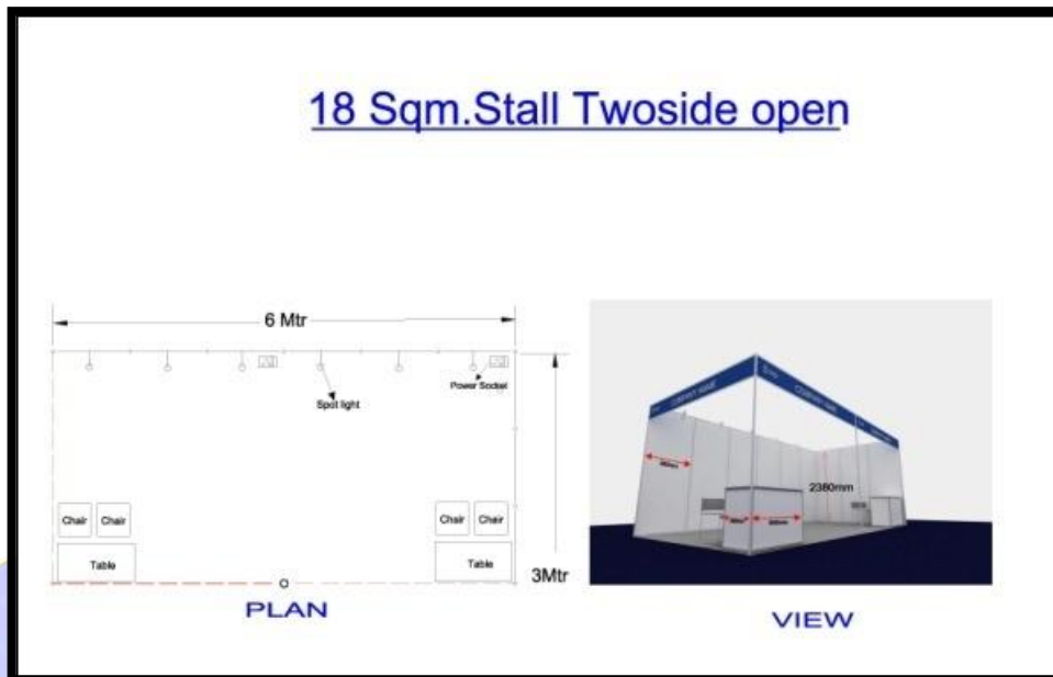
Fig - 3