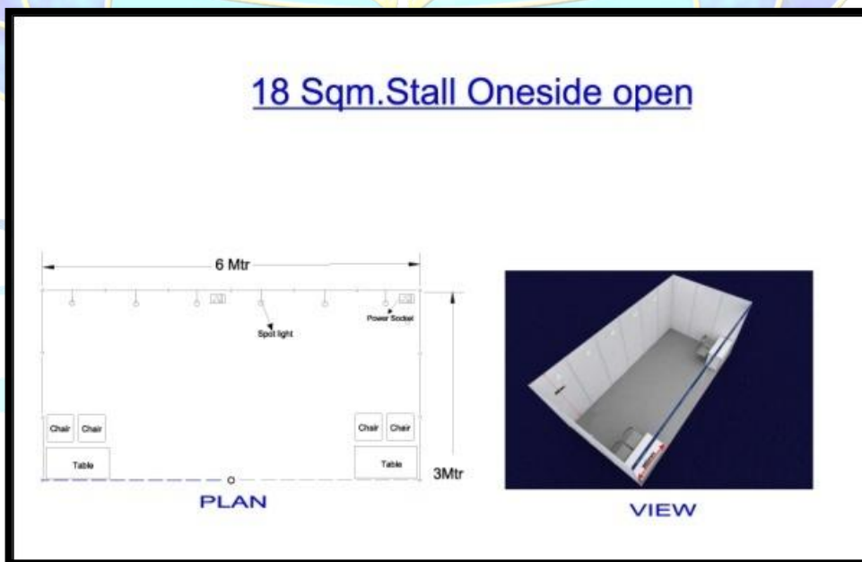
Fig - 2